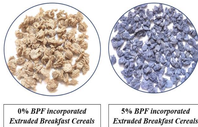
Fig 2: Extruded Breakfast Cereals Developed with Varying Levels of Blue Pea Flower Incorporation

Figure 2 shows the developed extruded breakfast cereals prepared with different levels of Blue Pea Flower incorporation, namely 0% and 5%. The 0% BPF formulation served as the control, while the 5% BPF formulation was developed to assess the effect of Blue Pea Flower