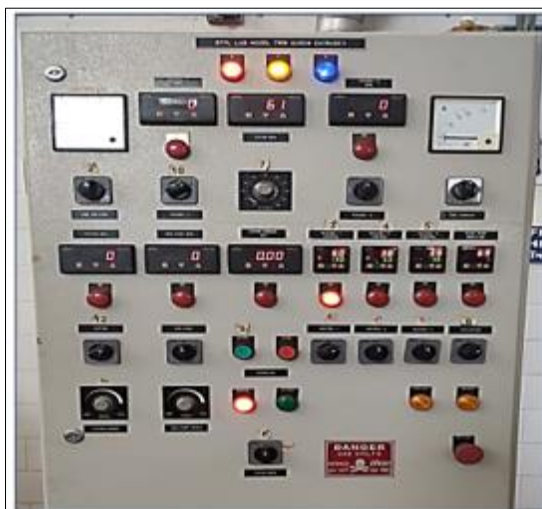
Twin Screw Extruded with the control Panel

and was fitted with temperature control, variable-speed motor and cutter assembly. The extrudates were dried in a hot-air oven at 100 deg C for 30 minutes to reduce residual moisture and improve shelf stability.