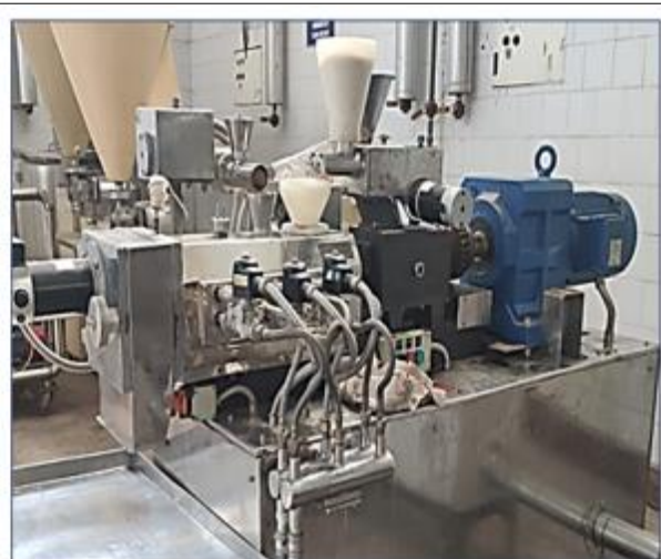
Twin Screw Extruded with Feeder Assembly